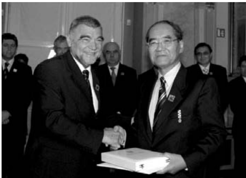
Stjepan Mesić, President of the Republic of Croatia, with Koïchiro Matsuura, Director-General of UNESCO