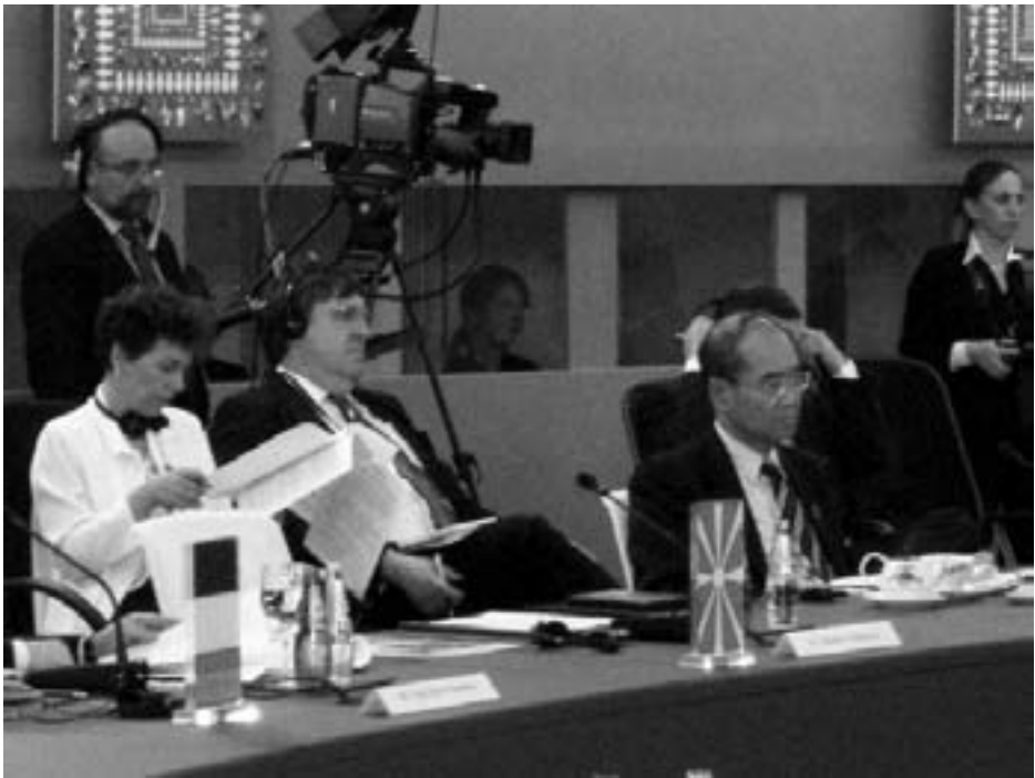
The Opatija Regional Forum on Communication of Heritage