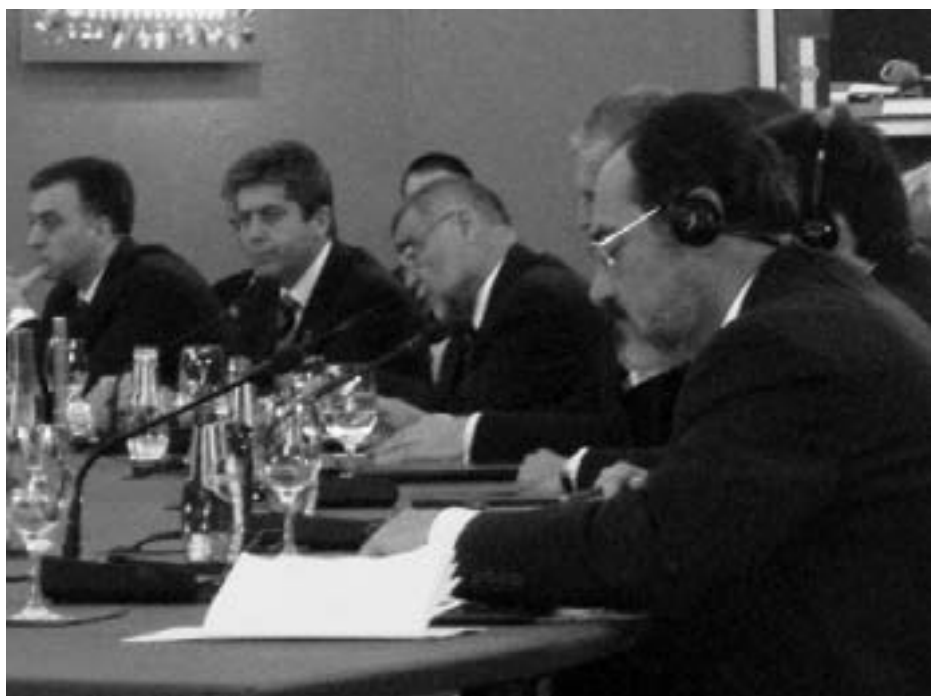
The Heads of State/Government at Opatija Regional Forum on Communication of Heritage